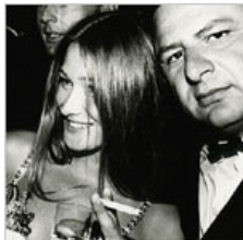
Berliners Get a Crash Course in Paparazzi Art