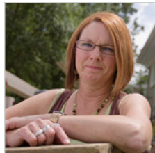
Women Are Now Equal as Victims of Poor Economy