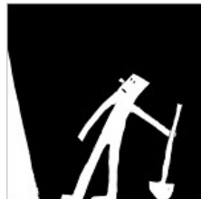
Letters: The Plight of Debt-Ridden Americans