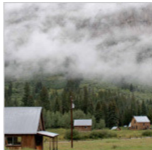
Where Research and Tourism Collide